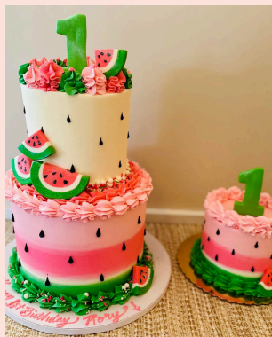
2 tier 30-40 serving All buttercream cake/ Fondant accents $300/ Smash Cake $45