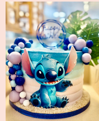
Buttercream Cake/ Fondant Accents & Ball Toppers 8 inch $175