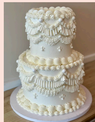
2 tier 30-40 serving All buttercream cake $285