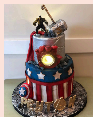
2 tier 30-40 serving All FONDANT Cake with 3D accents $480