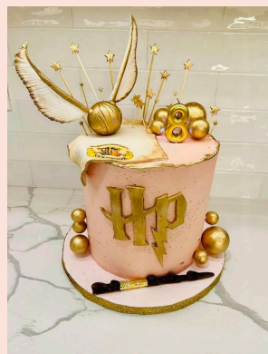
Buttercream Cake/ Fondant Accents 8 inch $195