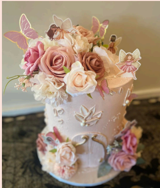
Buttercream Cake Faux Flowers/ 8 inch $195

*PRICING MAY CHANGE SLIGHTLY DUE TO YOUR SELECTIONS- THIS IS JUST TO GIVE IDEAS! *