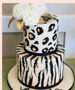
2 tier 30-40 serving All FONDANT covered /handpainted $360