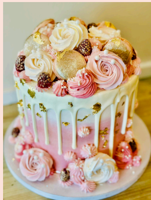
Buttercream Cake/ Fruit/ Macaron Accents 8 inch $175