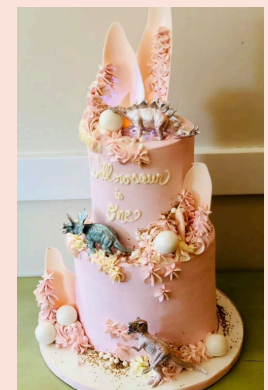
2 tier 30-40 serving All buttercream cake/ accents & chocolate pieces included. $325