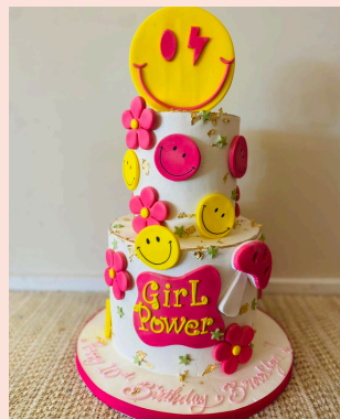
2 tier 30-40 serving All buttercream cake/ Fondant Accents $360