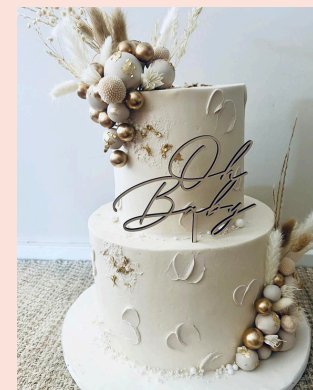
2 tier 30-40 serving All buttercream cake/ accents included. $285