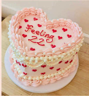
Buttercream Heart Cake with pearls 8 inch $175