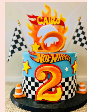
Buttercream Cake/ 3D Fondant Accents 8 inch $225