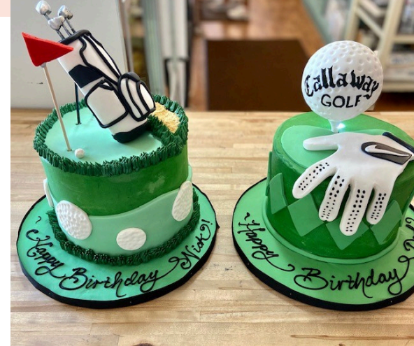
WE ARE KNOWN BEST FOR OUR BUTTERCREAM CAKES WITH FONDANT ACCENTS LIKE ABOVE PHOTO

Rainbow, Ruffled or Rosette Buttercream Cakes - start at $8.50 per serving ($85)