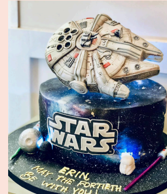
12 inch round All fondant with 3D Fondant Ship $750