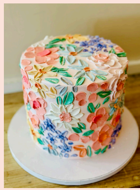
Buttercream Cake/ Palette Knife Flowers 8 inch $195