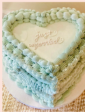
Buttercream Heart Cake 8 inch $145