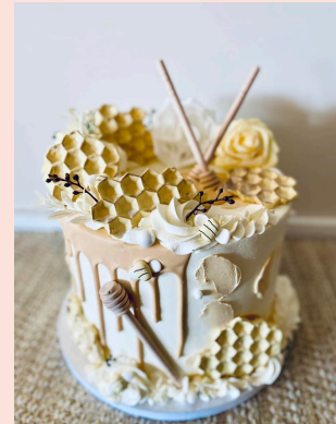
Buttercream Cake/ Fondant Accents 8 inch $175